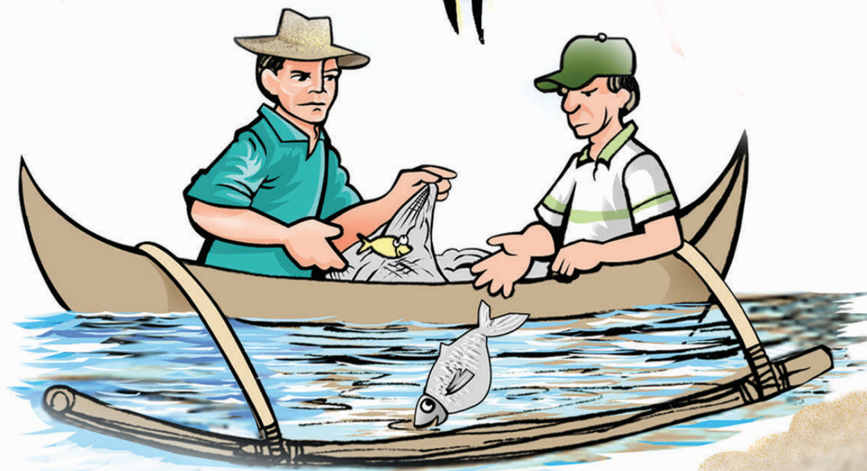
Pag kawah ha kaibanan inah istah amu in awn pihak niya