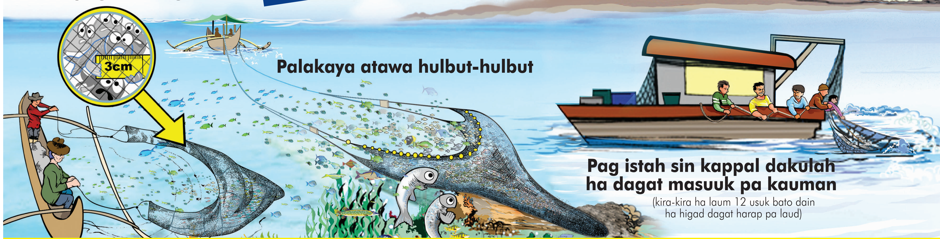
Palakaya atawa hulbut-hulbut