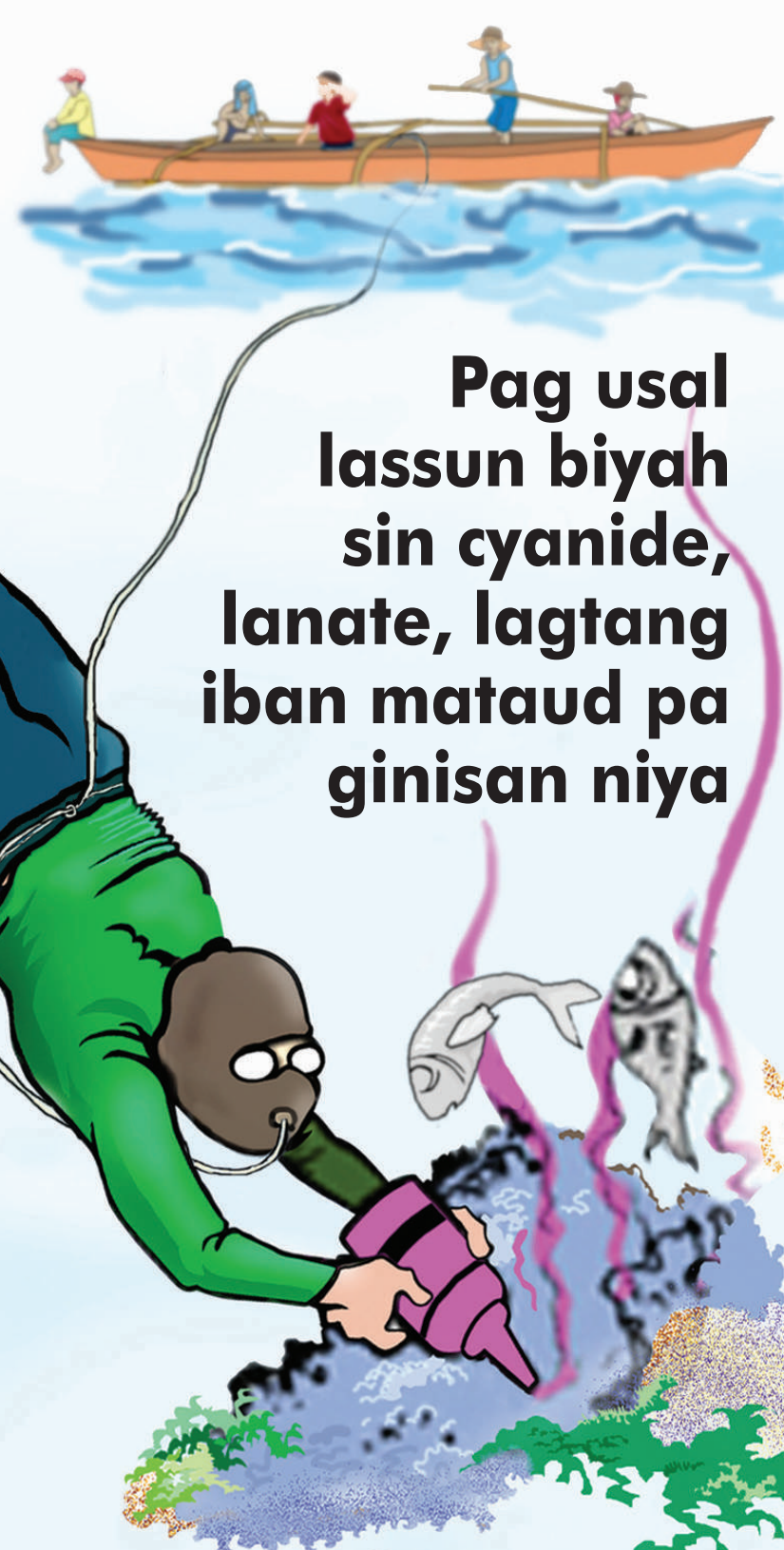
Pag usal lassun biyah sin cyanide, lanate, lagtang iban mataud pa ginisan niya