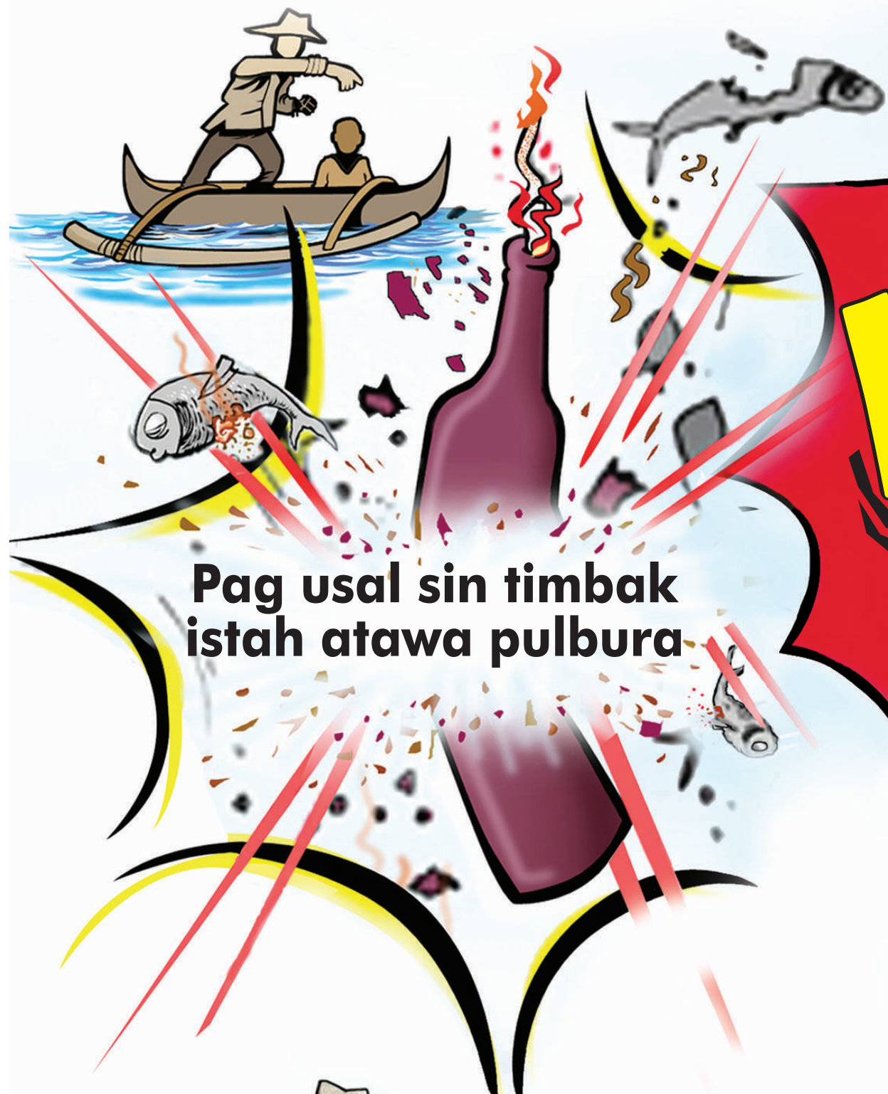
Pag usal sin timbak istah atawa pulbura