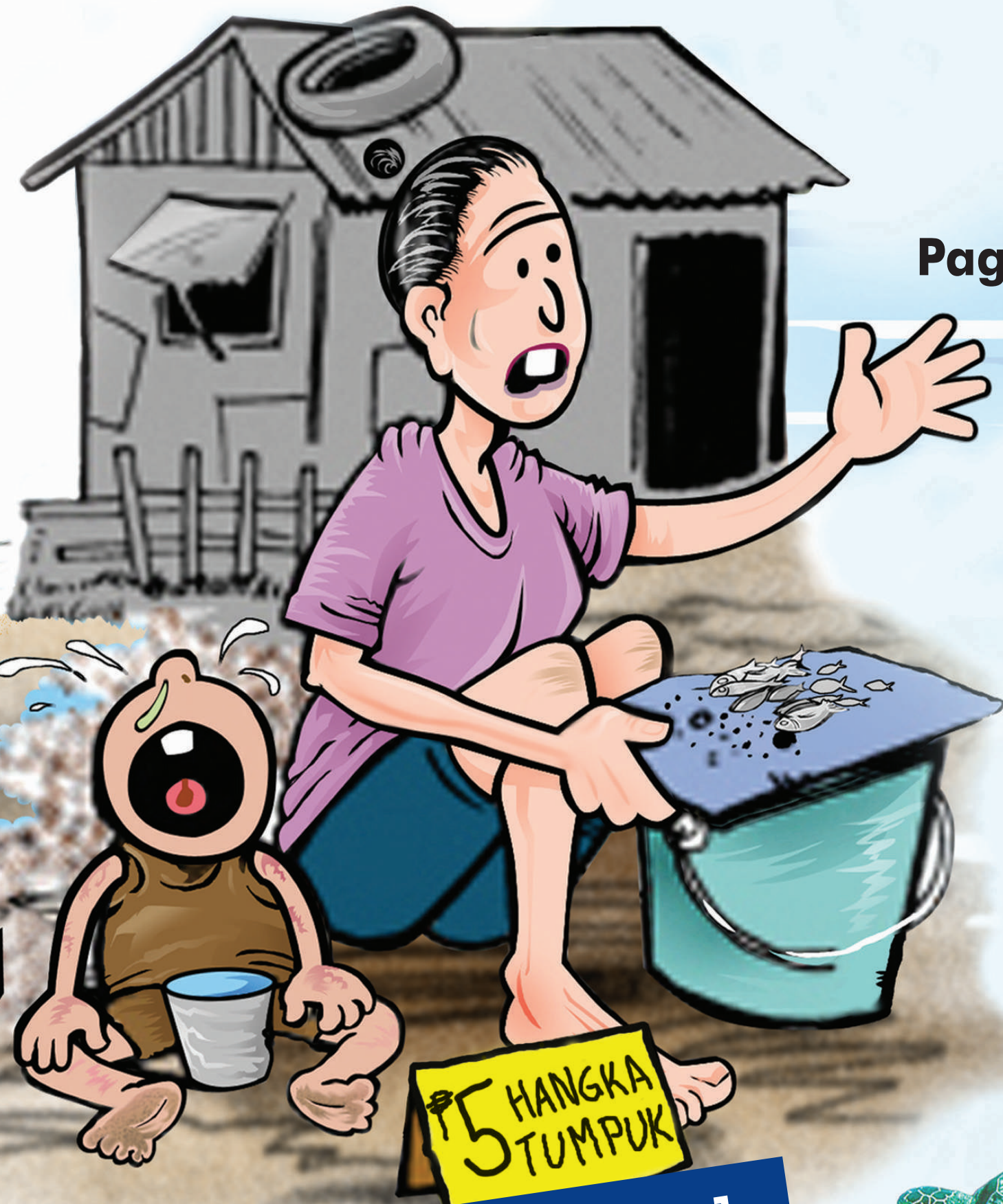
Pag kawah sin mga gusuh atawa sahasah