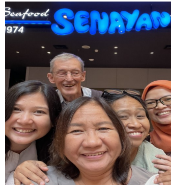
With former SEA Project staff in Indonesian Restaurant.