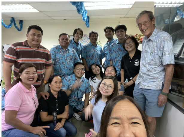
With CCEF in Cebu, Phils. We co-founded in 1998.