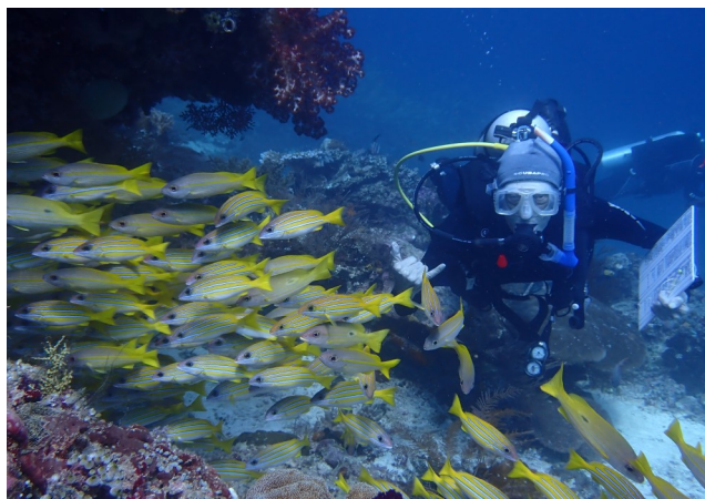
Great diving in Raja Ampat, Indonesia